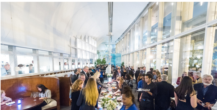
Main Dining Room and Restaurant

Located behind our stunning indoor-waterfall is our main dining room and mezzanine. This dining room boasts sky-high ceilings with floor-to-ceiling windows, offering your group an exciting and lively dining atmosphere unlike any other. Between the two floors, this space can accommodate a maximum of 150 guests seated or standing. Incorporate the Blue Room and Blue Alcove and enjoy space able to accommodate up to 300 people for a reception or 220 people for a seated dinner.