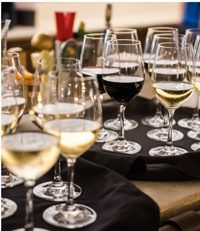
Selection of Mediterranean Wines