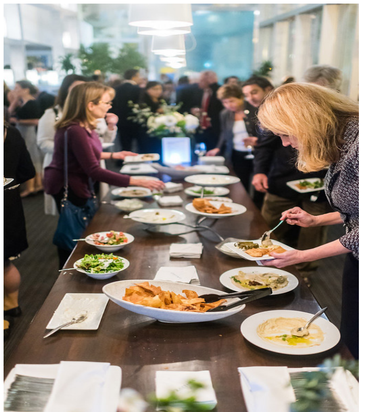
Receptions in the Main Dining Room